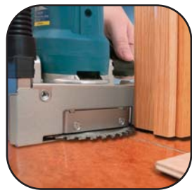
• Cutting door frames