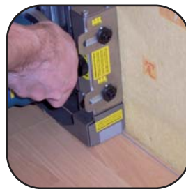
• Doing expansion join