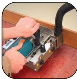
• Trimming skirting