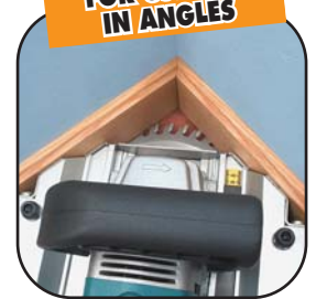
• Cut in angles