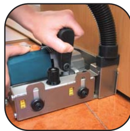
• Trimming doors